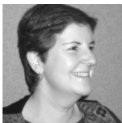
New CSV Executive Director