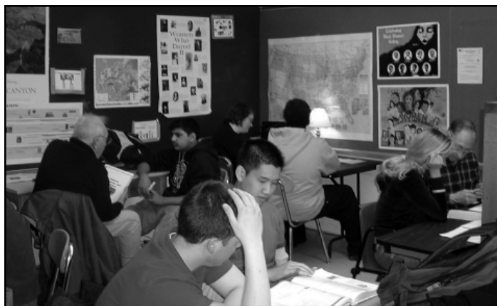
Four pairs of tutors and students working together on a typical day in the Tutoring Center.